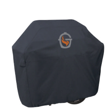
Cooker Cover For 20.5" Cooker