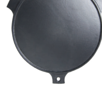
Deluxe Porcelain-Coated Cast Iron Searing Plate For 14" & 20.5" Cookers