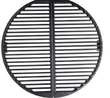
Deluxe Porcelain-Coated Cast Iron Grates For 14" & 20.5" Cookers