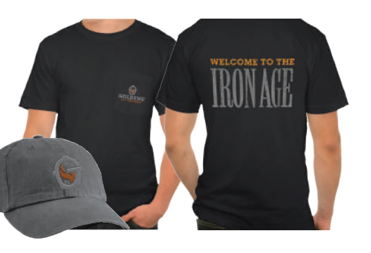
Shirts & Baseball Caps Top quality. Welcome to the Iron Age!